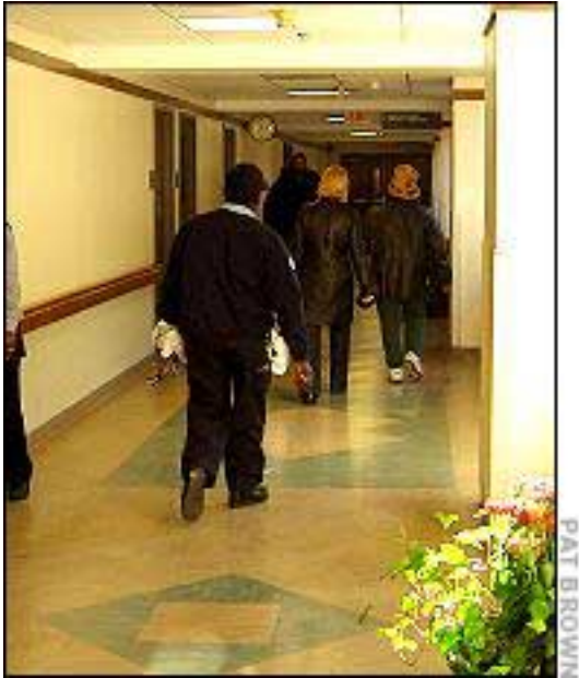
WHC inside corridor