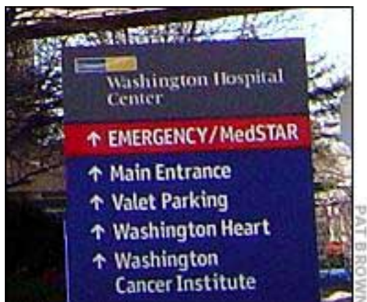
Washington Hospital Center sign

I was out of the house within five minutes. It was my policy to be at the hospital in emergency situations as quickly as humanly possible. Even in the wee hours of the morning with no red lights, the minimum time needed for the drive was twenty-two minutes. My estimated time of arrival was approximately thirty minutes from the time I was notified to the time I hit the front door of the hospital. I still had to sign in at security, show my ID, sign in again with the dispatch office on the interpreter's log, then get over to the emergency room. By that time, forty minutes or more would pass, leaving the patient without any suitable method of communication with the doctors and nurses. My heart went out to the poor woman who had suffered a traumatic event and now was struggling to relate what happened.