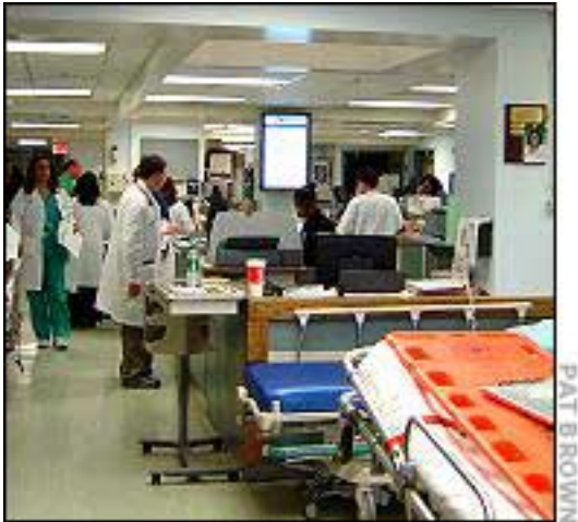
WHC nurse's station

Before I could respond, the nurse came in to do the rest of the rape kit. The kit involves performing a vaginal exam, taking swabs to test for semen, and looking for signs of injury. Angela had no bruises on her, and she stated that she was forced into vaginal sex and not anal or oral sex. There were no tears or abrasions to her vagina, although a lack of abrasions is not always proof that one wasn't sexually assaulted.