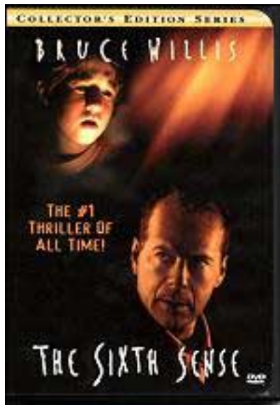
The Sixth Sense, videocover

When the kids get older, they are rarely suffocated, but can be abused and killed by other means. The movie "The Sixth Sense," for example, showed a MSBP mother feeding her child poison until she died.