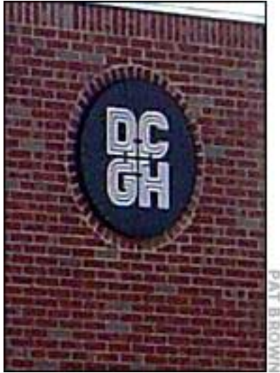
D.C. General Hospital logo

"We have the victim of a sexual assault." Good God, what was going on in this town?